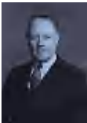
SUE LONGWORTH Museum & Archive at NGH

Albert Edward John 7th Earl Spencer was the last of that family to serve the Northampton hospital, now on its present site. He served loyally from 1935 – 1948 on various committees and was the last to hold the title of Grand Visitor. There was a Staff of Office that was used when carrying out inspections, looking rather like a billiard cue, which we still hold in the archive. He was amused by the fact that in his role and as a peer acting as Management Committee Chairman he actually served under the radical socialist Minister of Health, Mr Aneurin Bevan, who formulated the NHS, but which gave him connections in high places which proved useful to the hospital. When the new out-patient block was being planned there appeared to be a 2-year delay with obtaining planning permission. Lord Spencer took a trip down to London and spoke to certain parties and came back with immediate building permission to proceed. On top of that he got a promise that the Queen Mother would lay the foundation stone for the building which she duly did on 25 October 1956. His hospital role along with many other public figures in the county terminated in 1948 when the National Health Service was introduced.